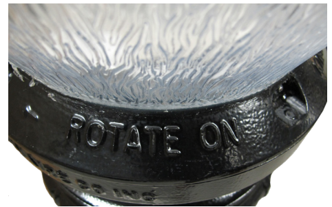
STEP 6: PLACE THE LED CONVERSION KIT GLOBE ON THE CAPITAL AND ROTALOCK™ IT INTO PLACE OR ENGAGE THE SET SCREWS IF A NON ROTALOCK™ GLOBE IS PROVIDED