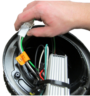
STEP 5: CONNECT THE LED POWER LEADS