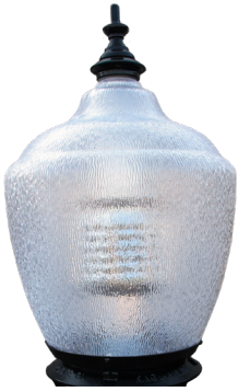
STEP 1: DETERMINE THE HID FIXTURE YOU WISH TO CONVERT TO LED