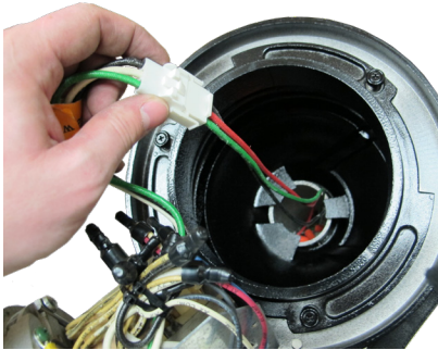
STEP 4: UNPLUG THE HID POWER LEADS FROM THE BALLAST ASSEMBLY